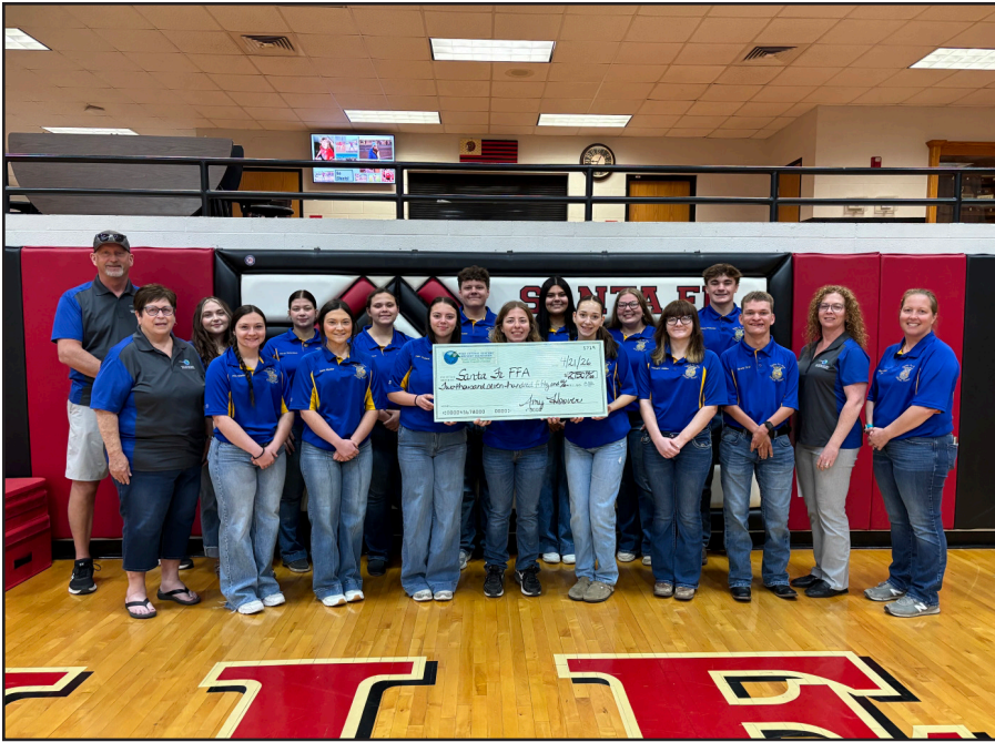
Santa Fe FFA $2,750 Grant will provide funding for the Backsnack Program.