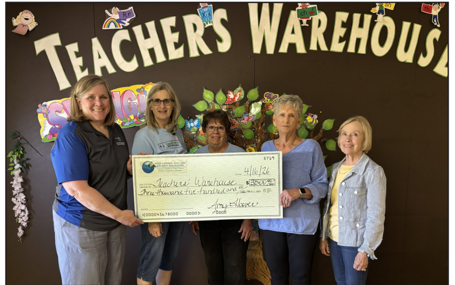
Teachers' Warehouse of Johnson County $3,500 Grant will be used for supplies for student and teacher needs throughout the school year.