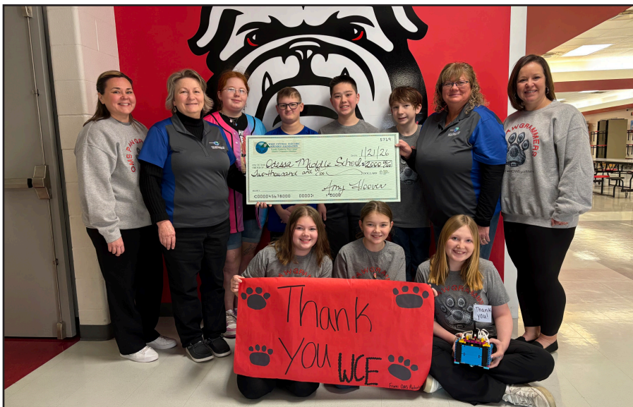
Odessa Middle School $2,000 Grant will be used to expand the OMS Robotics Club and purchase equipment.