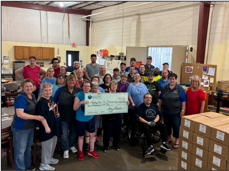
Lafayette County Enterprises $2,000 Grant will be used to provide signage for the building and recycling lot.