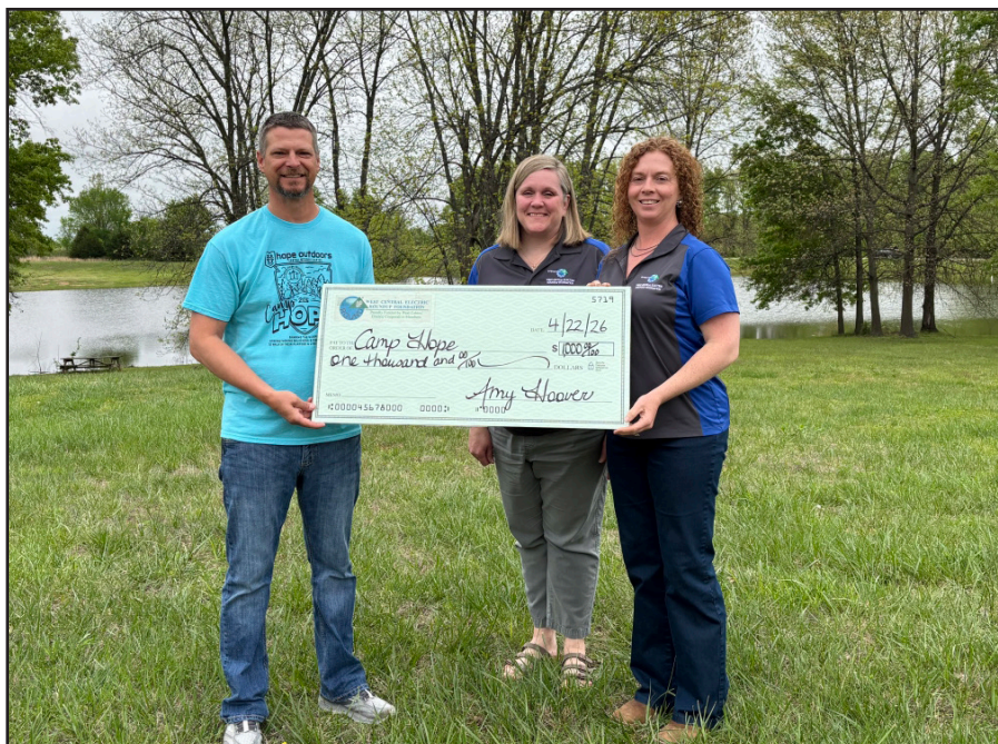
Camp Hope $1,000 Grant will help support a 4-day, 3-night family summer camp for families facing disabilities, medical illness or struggling through a difficult season in life.