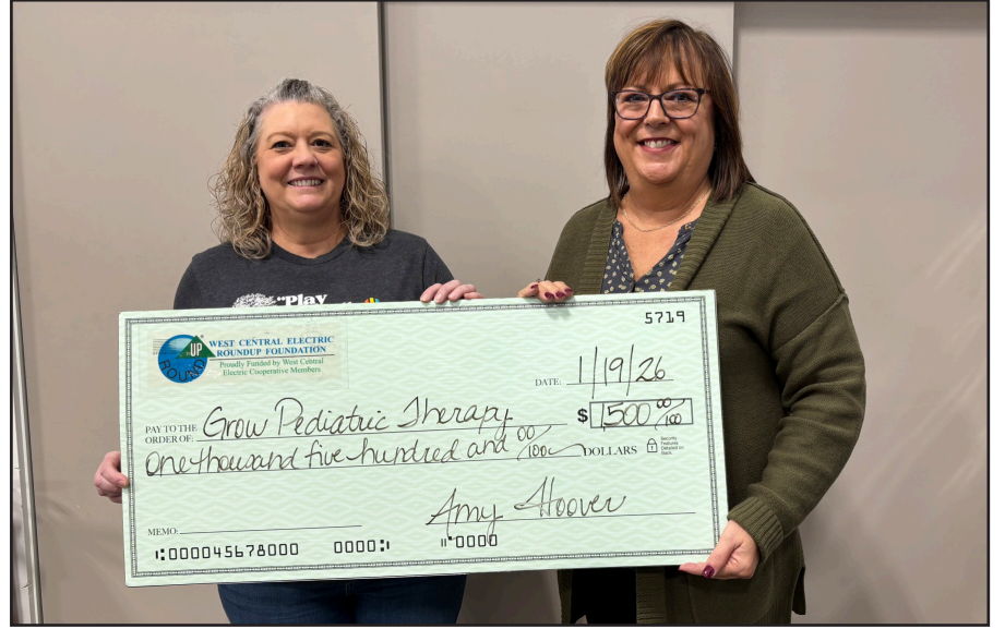
Grow Pediatric Therapy Services $1,500 Grant will be used for their "Socks for Students" program.