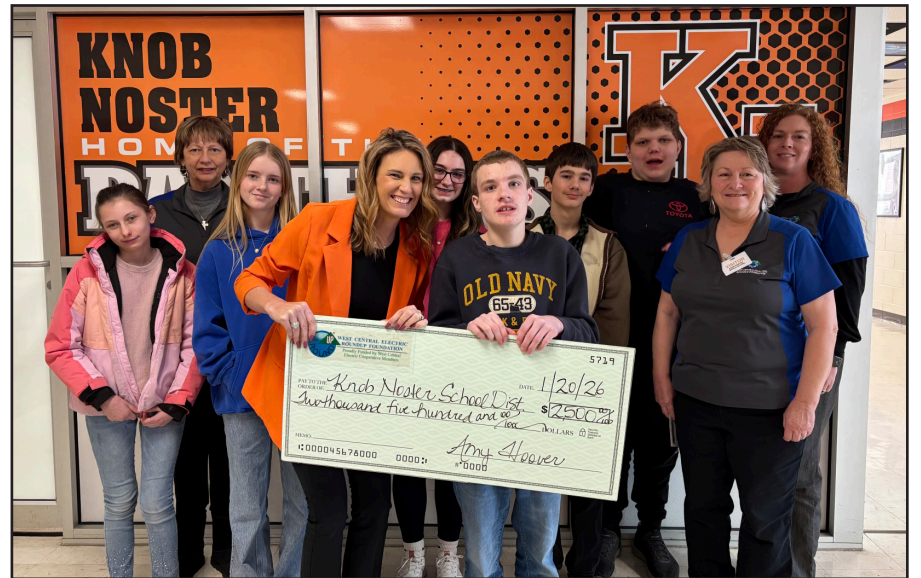
Knob Noster School District $2,500 Grant will be used to start a Special Olympics program.