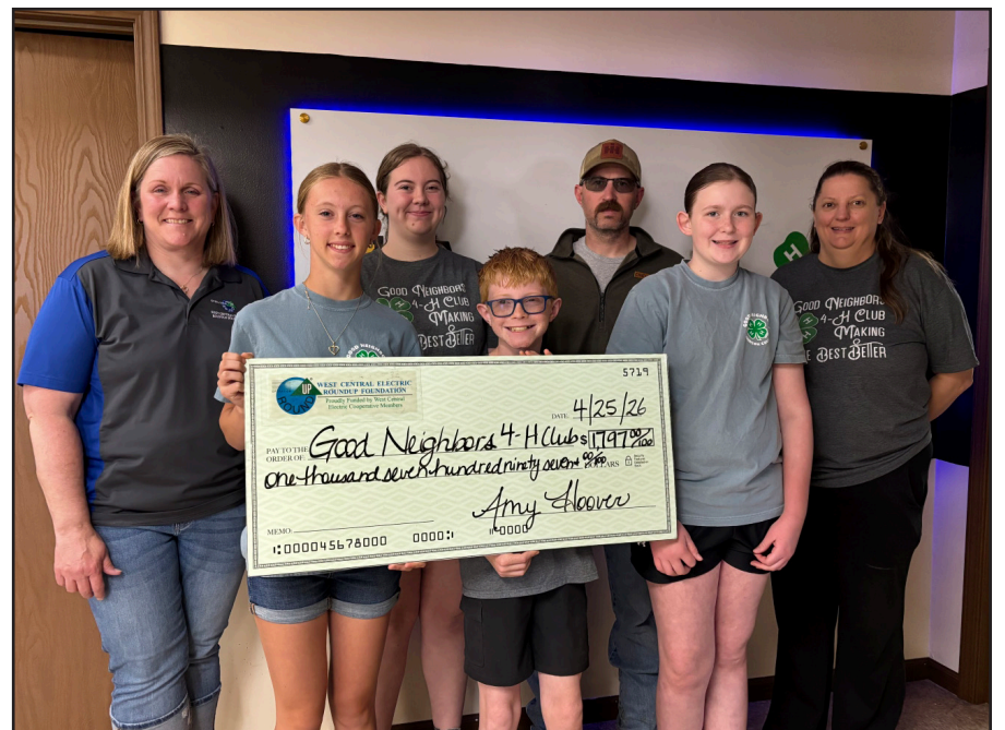
Good Neighbors 4-H Club/Jo. Co. Extension Center $1,797 Grant will be used for an AED and first aid kit to be available at all 4-H and Extension events.