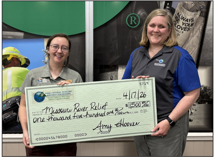
Missouri River Relief $1,500 Grant will help fund large-scale, community-driven clean-up events along a stretch of the Missouri River, primarily in Jackson, Lafayette and Saline counties.