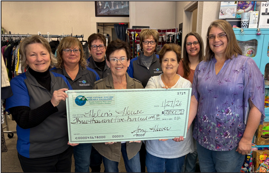
Helen's House of Odessa $3,500 Grant will be used to restock supplies and necessities.