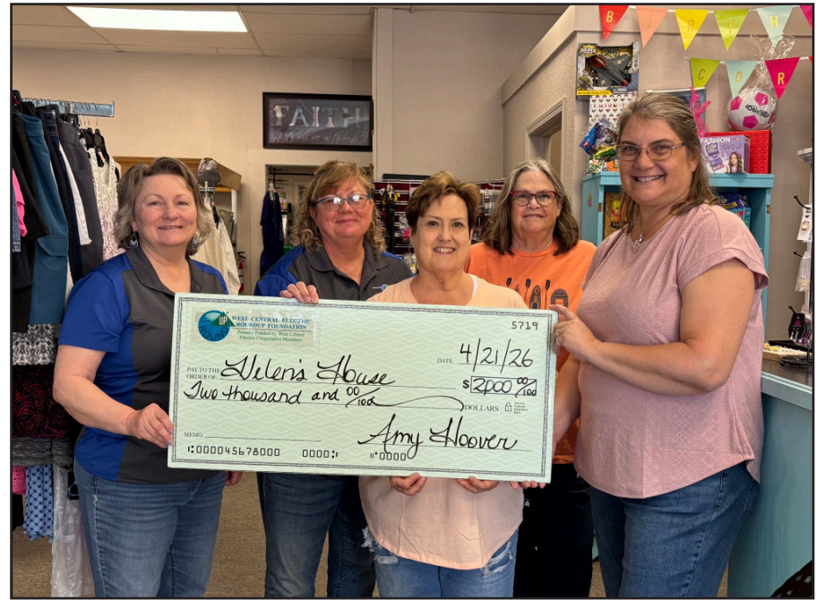
Helen's House of Odessa $2,000 Grant will be used for their back-to-school event providing undergarments and accessories for kids.