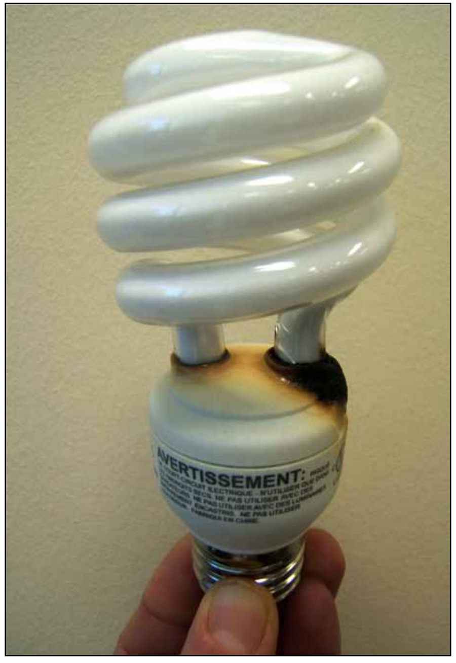
BURNED OUT... The burned area at the base of this compact fluorescent lightbulb shows that it has ended its life properly, and is a normal part of the process.