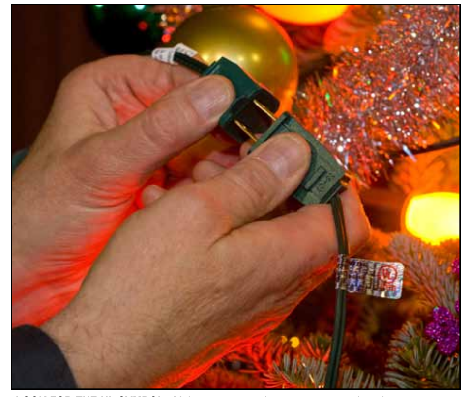
LOOK FOR THE UL SYMBOL... Make sure connections are secure and cords are not worn or frayed. Remember the UL symbol ensures the item meets safety standards.

orried when you hear a sa compact fluorescent lightbulb sh (CFL) pop or sizzle? Despite th confusion caused by an e-mail hoax CL circulating since April 2010, these la sounds signal the bulb is working popping noise, and even a slight odor are pl typical and do not pose a fire risk as bl claimed in the misleading e-mail. sa