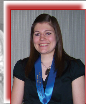
Youth Tour Winner