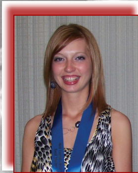
Youth Tour Winner