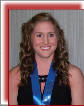
Youth Tour Winner