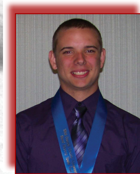
Youth Tour Winner