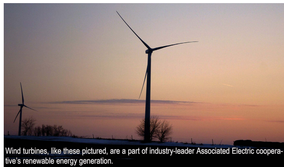
Wind turbines, like these pictured, are a part of industry-leader Associated Electric cooperative's renewable energy generation.

Through the Cooperative Action Network grassroots campaign, you can join in a dialog on how your electric cooperative balances protecting the environment and keeping electricity affordable. Please join the conversation today by visiting www.action.coop .