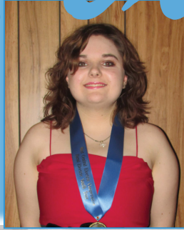
Youth Tour Winner