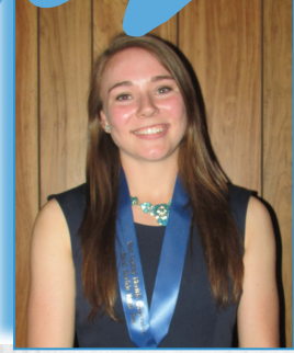
Youth Tour Winner