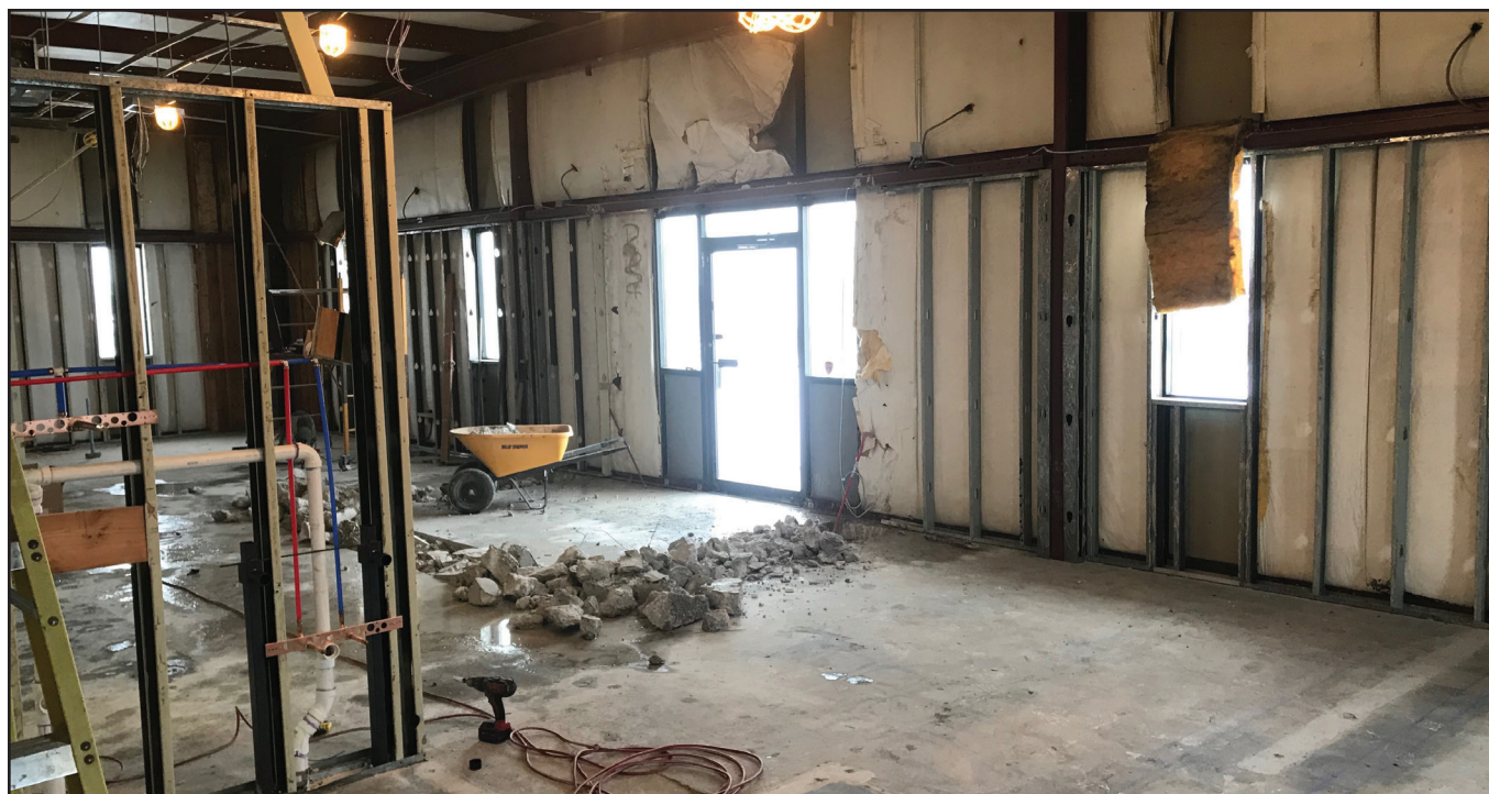
MAKING PROGRESS... Renovations are moving right along at the Oak Grove facility. This view is from inside the front office looking at the front door.