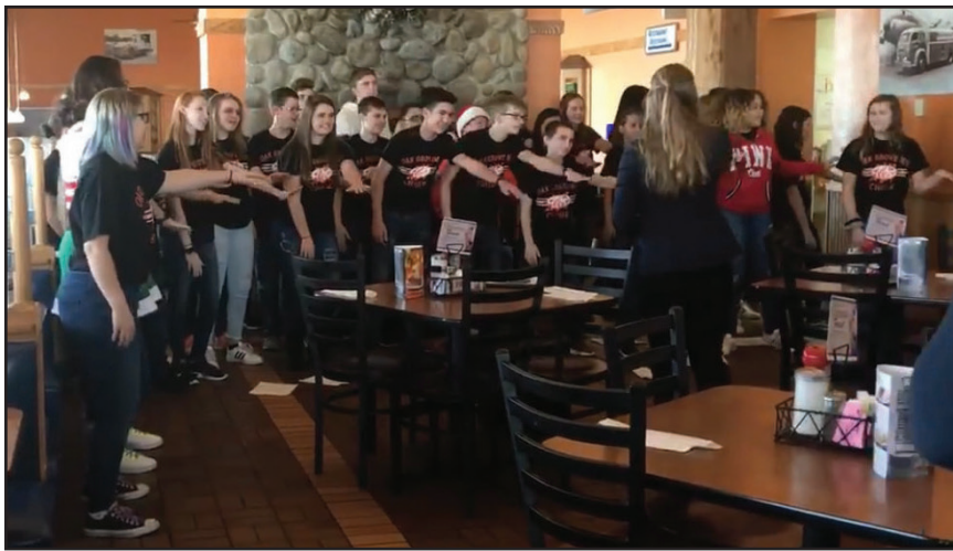
CHRISTMAS ENTERTAINMENT... Members of the Oak Grove Middle School choir entertained those attending the monthly Oak Grove Chamber of Commerce meeting in December with Christmas songs. This was their rendition of, "Run, Run, Rudolph!"

The last day the office will be open for normal business until renovations are complete will be Friday, Feb. 1. Septagon Construction Co. will begin renovations on the office building Feb. 4.