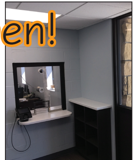
After months of renovation, the Oak Grove office is back open. There are still a few things to wrap up, but the office is officially open for business.